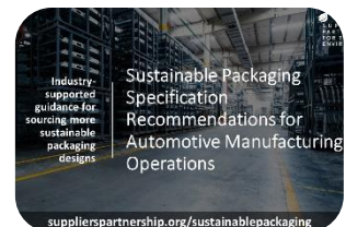
Auto Industry Partnership Drives Sustainability in Packaging

Learn more and join us at: www.supplierspartnership.org