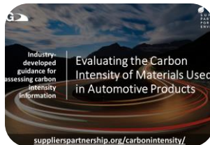
New Guidance for Evaluating the Carbon Intensity of Materials Used in Automotive Products