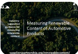
New Guidance for Measuring Renewable Content of Automotive Products