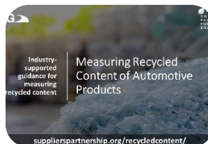
Automotive Industry Develops New Guidance for Measuring Recycled Content of Automotive Products