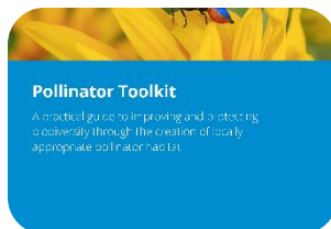
Automakers and suppliers work together to support over 2400 acres of pollinator habitat across their operations