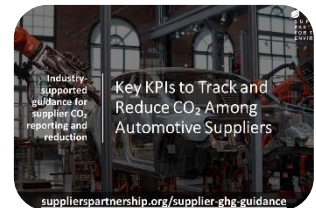
Automakers Collaborate on Common Guidance for Supplier Carbon Reporting and Reduction