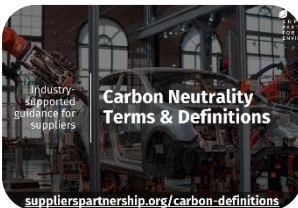
SP Publishes New Guidance on Carbon Neutrality Terms & Definitions