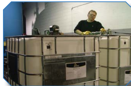
Aevitas Specialty Services employee prepares customized Gemline Series products.

The latin term "aevitas" closely translates as the "time through which something lasts." Key values of the organization such as integrity and responsibility reflect continuous commitment to sustainability and building relationships on mutual trust, ethical conduct, and respect for the environment and human health. This commitment also assures customers and clients that the collection, treatment, and disposal of these materials are carried out in an environmentally responsible manner to protect future generations and the communities in which they are located.