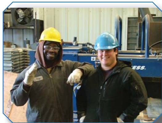
Employees of Aevitas Specialty Services.

Aevitas Specialty Services is revitalizing a once vacant Detroit processing plant, bringing green jobs and tapping local talent while promoting the recycling and reuse of industrial oils in the automotive supply chain. The company is looking to expand its services and product lines by investing in Detroit and enhancing involvement with the automotive and energy sectors. An original, historic manufacturing building and some existing equipment will be redeveloped and retrofitted into a state of the art facility, that will implement current technologies for treatment and environmental protection. The 25 member staff currently employed by Aevitas Specialty Services will relocate to the new facility when it becomes operational. An additional 6 new jobs that include both management and operations will also be created in the city.