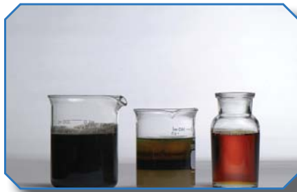
Treated industrial waste oil.